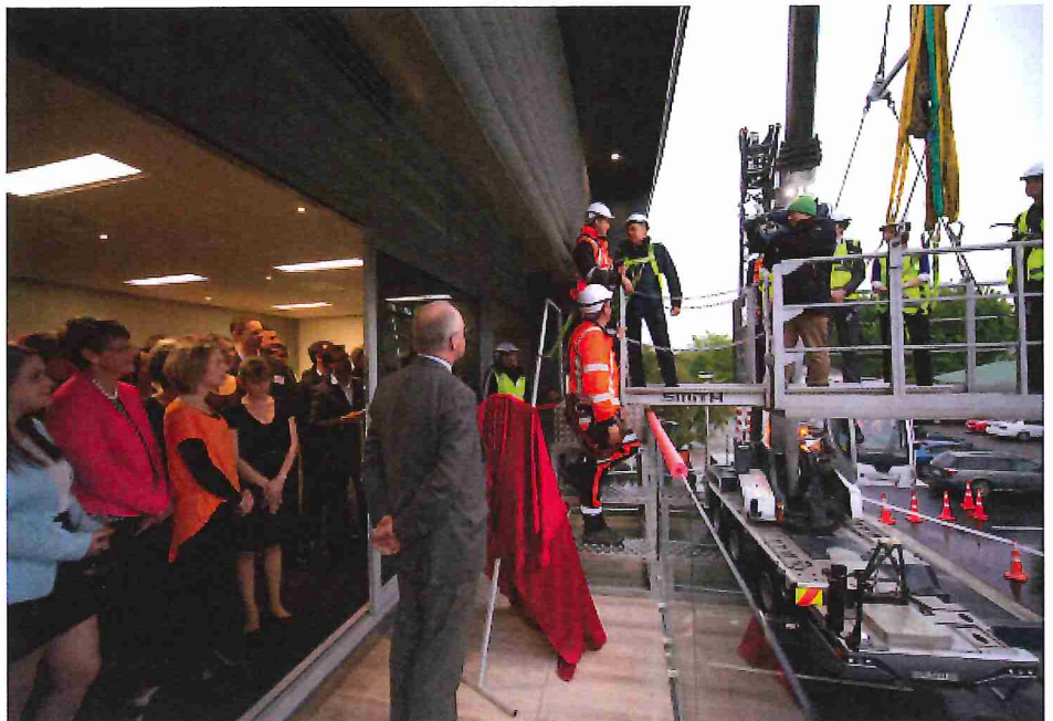
The tumultuous events of 22 February 2011 are recalled as staff of Smith Cranes take part in the ceremony to open the new Parry Field building in Riccarton.